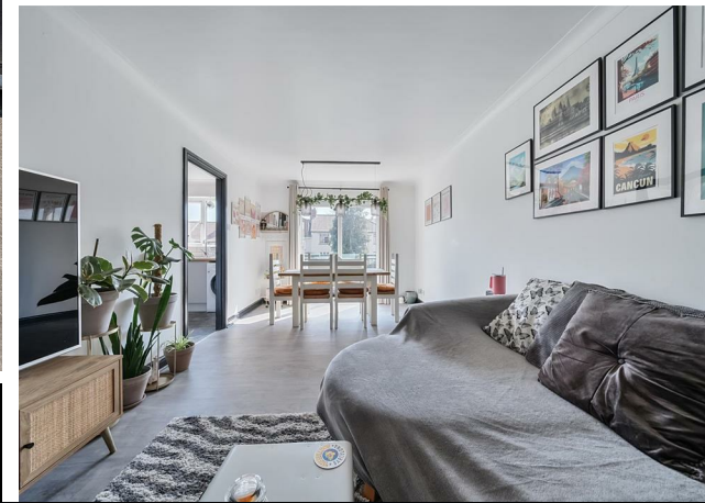
Beechmount Court, Beechmount Grove